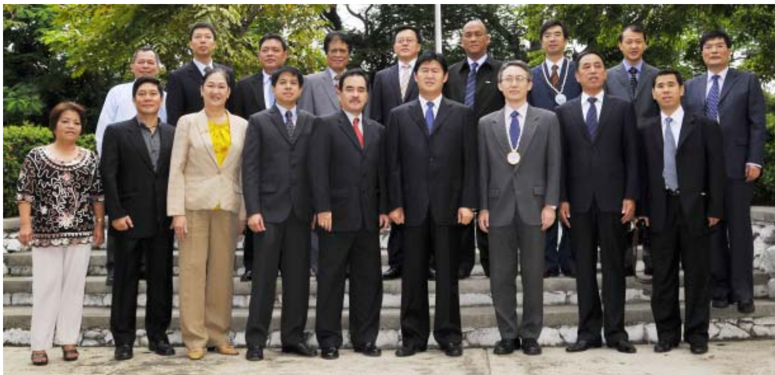
BUILDING FRIENDSHIPS AND ENABLING OPPORTUNITIES Officials of NAMRIA, NASG, and the Chinese Embassy in the Philippines pose for a photo op prior to their meeting which aimed to advance the geomatics industry in both countries.

Leaders of the National Administration of Surveying, Mapping and Geoinformation (NASG), the administrative organization in charge of surveying and mapping work in China, paid a technical visit to NAMRIA last 20 September to explore possible areas of cooperation between China and the Philippines in the field of geomatics.